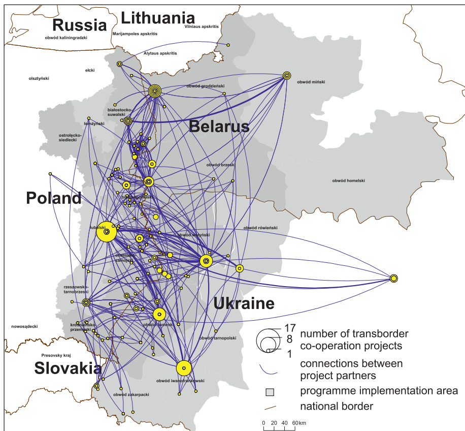
Figure 2. The spatial distribution of project beneficiaries by number of projects and connections within projects under the Poland-Belarus-Ukraine 2007-2013 Cross-border Cooperation Programmes.

Cooperation between institutions based in the borderland's most important cities formed the main axes of connections. Given the limited activity of Belarusian institutions, a markedly greater number and intensity of connections was noted in the borderland's southern part. This effect was so marked that, notwithstanding the proximity of Belarus, Polish institutions located in the northern