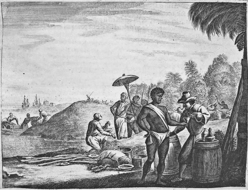
1. Olfert Dapper, The trade between the Europeans and the Africans on the shore of West Africa

Behind the first scene a European merchant with his head uncovered kneels before the local ruler, most probably that of one of the states of the Wolof people. The merchant is holding a bottle in one hand and is making a gesture of greeting and honour with the other. Most probably he is also offering a drink as a gift to begin trade negotiations. The ruler is recognisable by the attire covering his entire body, 25 as well as by the parasol held above his head by his suite made up of two persons. The latter are only wearing sashes on their hips but are armed with spears.