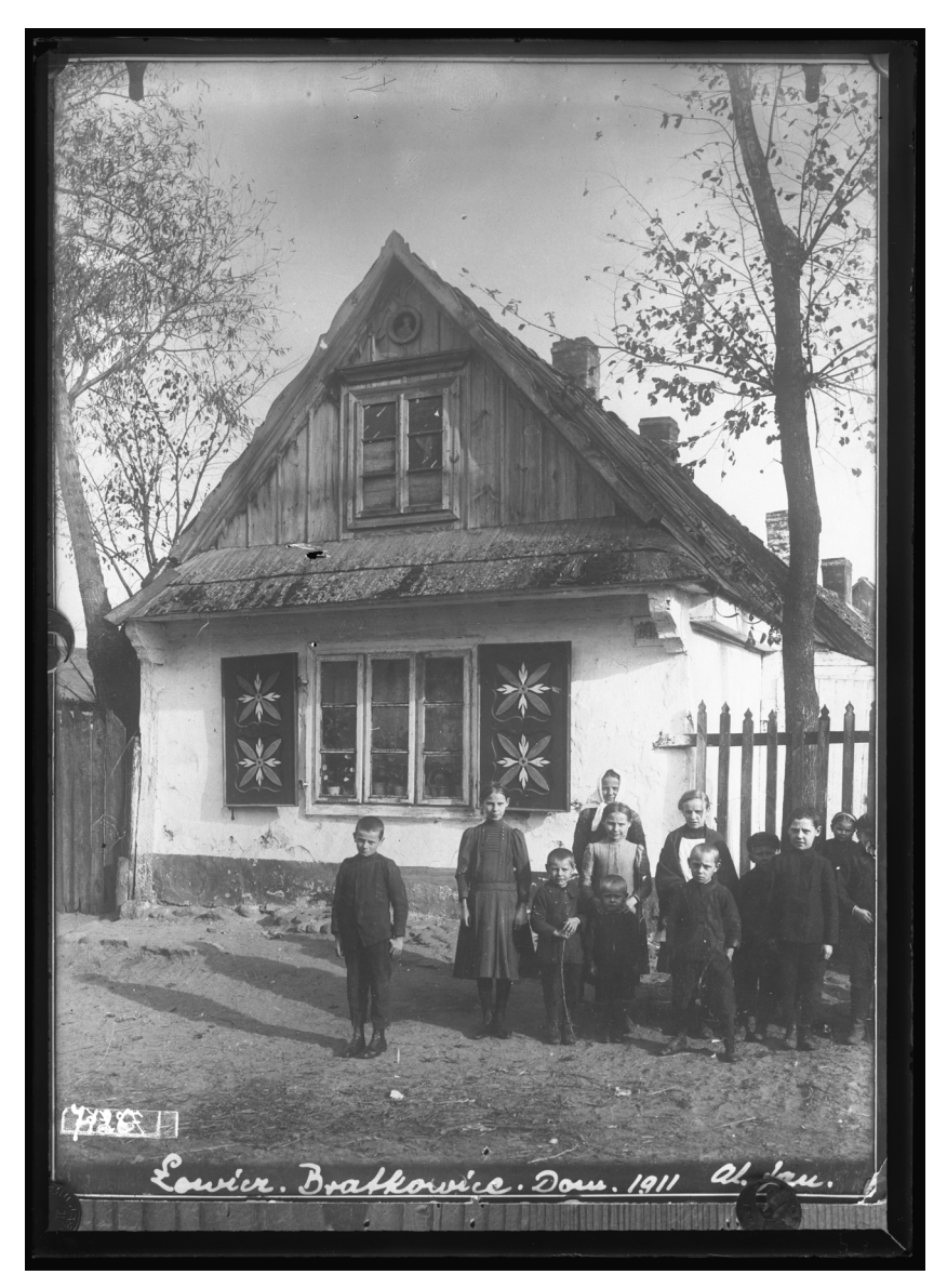
Fig. 4. A photograph from the Society for the Protection of Ancient Monuments' archive reproduced in the Wieś i miasteczko (Warszawa, 1916) and the Polnisches Bauernhaus (Berlin, 1917).