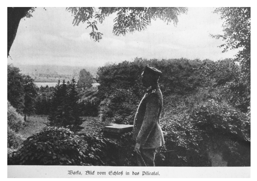
Fig. 1. A page from the album Das Generalgouvernement Warschau. Eine Bilderreihe aus der Zeit des Weltkrieges (Olbenburg, 1918).

photographic plates are described as "pictures and memories of the [wartime] experiences ... bringing to life the beauty of these lands." <sup>10</sup>