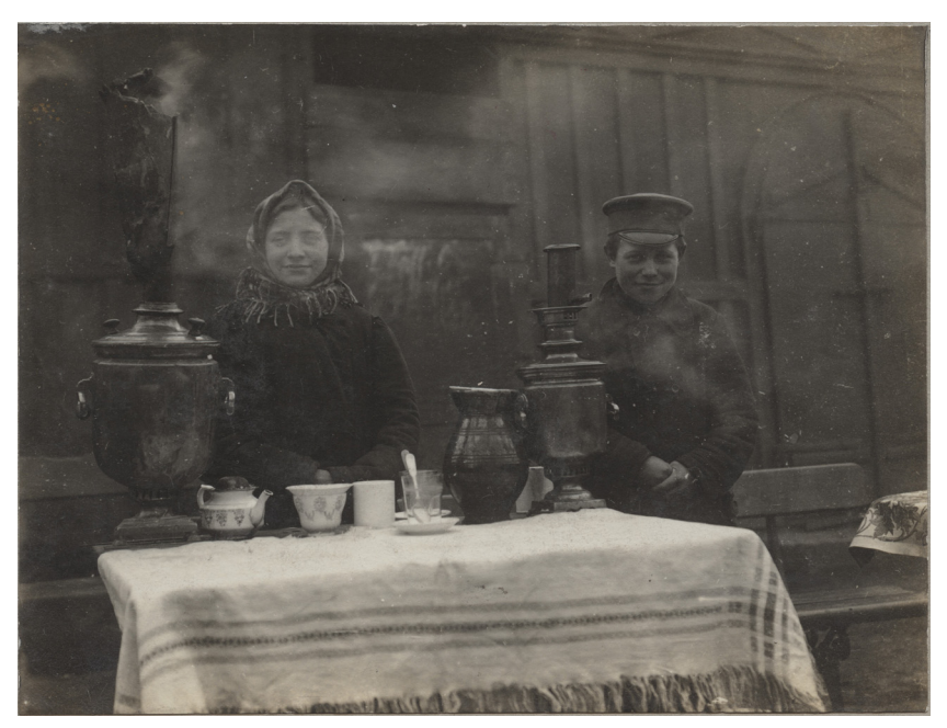
Fig. 2. Behmcke, A boy and girl with a samovar at the Łęczyca market, ca. 1917; Cracow, Ethnographic Museum, inv. no. III 17419.

possibly soldiers or military officials, whose names do not appear on the lists of the Kommission 's employees. Surprisingly, this collection goes well beyond the scientific and reveals several photographic personalities. Behmcke's pictures of the Warsaw Jewish sellers or of the Łęczyca region peasants are taken with an artistic eye and sensibility, and should be described more in terms of artistic portrait studies than ethnographic typology (fig. 2). Hans Praesent, the Kommission 's librarian and scholar responsible for statistical research, was particularly fascinated by the street market scenes of the towns and villages. Arved Schultz took numerous picturesque ethnographic impressions of the crowds before Sunday mass, playing children, and women carrying water.