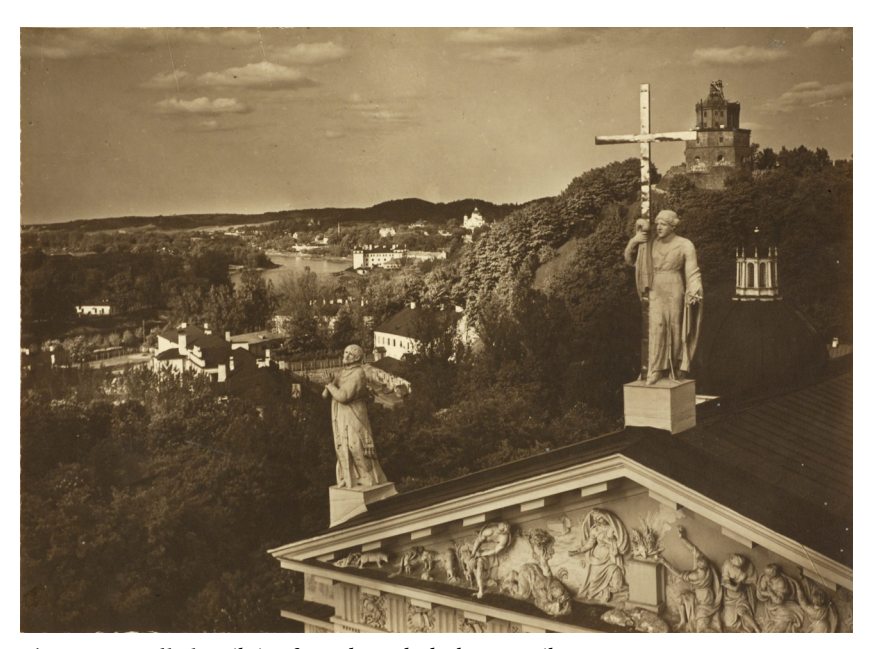
Fig. 5. Jan Bułhak, Vilnius from the cathedral campanile, ca. 1915.

from Jena University, appointed in winter 1916 as the conservator of Lithuania responsible for the registration of architectural monuments in the region. During his surveys, he organised popular lantern lectures addressed to German soldiers on the cultural and artistic landscape of the conquered lands, focusing in particular on Vilnius and illustrated almost exclusively with Bułhak's slides. The most captivating panoramas, views of the city and single monuments also filled the pages of Weber's booklet edited by the Zeitung der 10. Armee. 53 Wilna. Eine vergessene Kunststätte, defined in the introduction as a guide and a souvenir for the German soldier, was a comprehensive art history of the city's monuments filled with 135 illustrations. Starting with 7 encaptivating panoramas of the city, it continued with the views and details of the monuments under discussion. As already mentioned, the majority of illustrations consisted of Bułhak's survey photographs, which formed a visual narration in its own right. In the opinion of the German Kunstoffiziers on the Eastern Front, it was as important