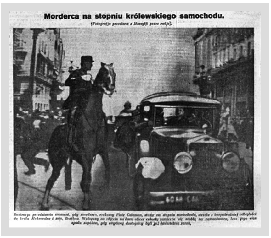
3. Photo of the moment of the attack in Marseilles; after: "Tajemnica spisku na króla Aleksandra i min. Barthou", Ilustrowany Kuryer Codzienny , 283 (12 October 1934), p. 1.

such as the ill-advised placement of the officers along the king's route and the disregard for the rumours about a possible attempt at his life, it was also revealed that no police patrol had been grouped on the square near the stock exchange, right next to the spot where the assassination took place.<sup>64</sup> Aware of their incompetence, the local police force proceeded with confiscating and censoring the film that clearly proved their shortcomings in securing the visit of the Yugoslav monarch.<sup>65</sup> Another questionable circumstance was the mysterious death of the author of the film, Georges Mejat, which occurred six days after the assassination.<sup>66</sup> It is possible that Mejat had been protesting against the confiscation and censorship of the film, to which the police responded by commissioning his murder; this issue, however, remains exclusively in the realm of speculation, given that an official medical certificate was issued, stating that Mejat had passed of natural causes.<sup>67</sup>