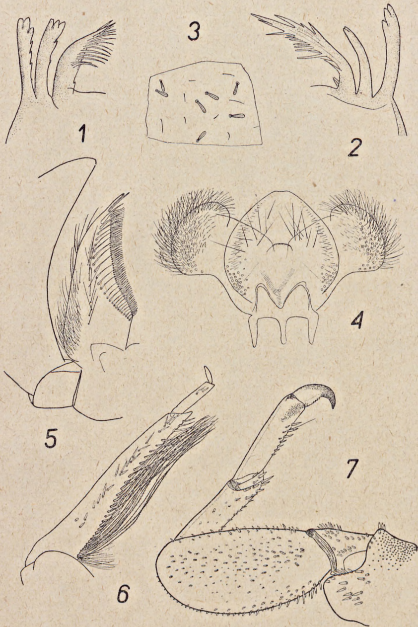
Plate I. The nymph Oligoneuriella mikulskii n. sp. Fig. 1, 2, canines and prosthecae of mandibula sinistra and mandibula dextra; Fig. 3. fragment of a wing pad of the first pair of the wings; fig. 4. hypopharynx; fig. 5. lacinia of the maxilla; fig. 6. fragment of the leg of the fore pair; fig. 7. leg of median pair.