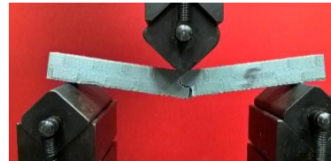
Figure 1. The crack propagation in sample 16a