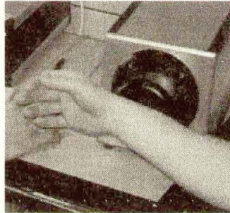
Fig. 2. OCT-scanner ( www.isis-optronics.de )

Similar to ultrasound, skin can be imaged non invasively over depth with OCT, utilizing broadband infrared light instead of sound waves. Because of the different underlying physics, contrast mechanisms in OCT are different compared to HFUS. Light, which is backscattered inside the tissue is interfered with light reflected in an optical reference path. Images depicting the optical backscattering properties of the skin are obtained detecting the interfered light with a photo diode. The optical path length in the measurement arm determines the axial measurement position, and lateral scans are performed with a mechanical scanning optics. For our measurements, a 'SkinDex 300' OCT scanner (ISIS optronics GmbH, Mannheim, Germany) working at 1300 nm wavelength is used. Images are acquired over a limited axial / lateral field of view of 0.9 mm / 1 mm with a 5 \mu\text{m} minimum axial and 3 \mu\text{m} minimum lateral resolution.