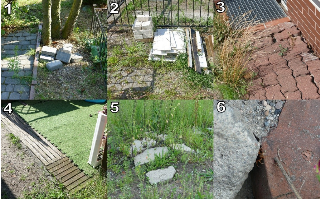
Figs 1–6. Świnoujście – sampling areas: 1 – the communal cemetery, 2–4 private apartment, 5 – among the rubble on the side of the road, 6 – Dysdera crocata among the rubble.