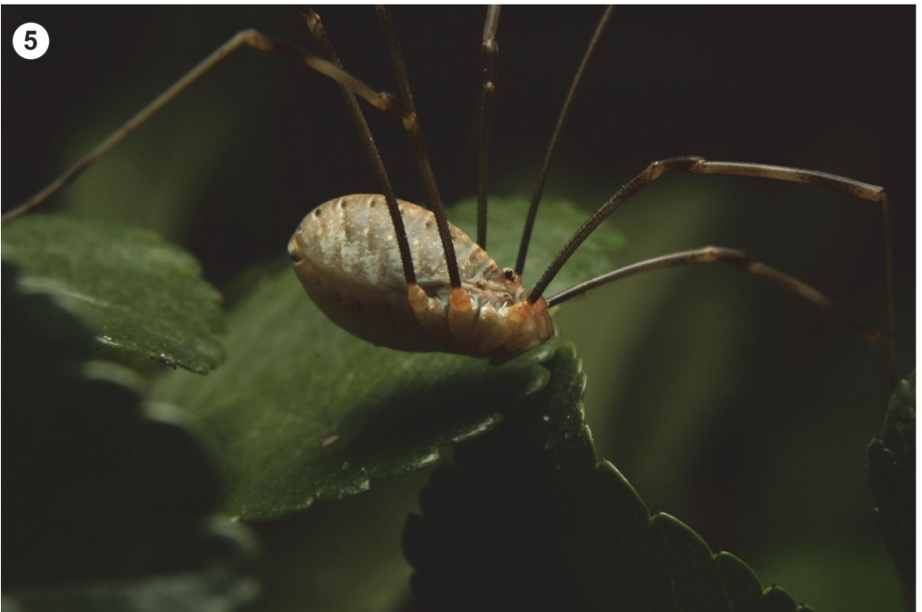
Figs 3-5. Opilio canestrinii : 3 – juvenile (phot. D. Majgier), 4 – male (phot. D. Majgier), 5 – female (phot. M. Wierzbicki),.