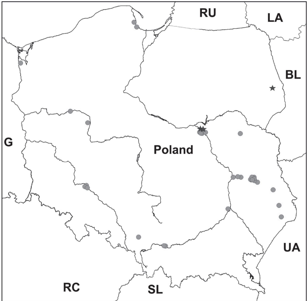
Fig. 1. Distribution of Opilio canestrinii in Poland: stars indicate the published data, dots – the new localities.

All Polish localities of Opilio canestrinii are in the lowlands (Fig. 1), from about 20–30 m a.s.l. (Moczyły, Sieraków) in the north of the country to 250–280 m a.s.l. (Sosnowiec, Tomaszów Lubelski) in the south. In parentheses are data already published (Starega 2004).